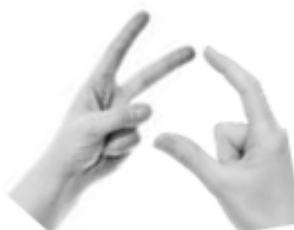
Make Good Decisions